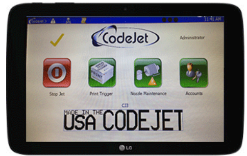
Touch Screen or Tablet With Universal Icon Menu