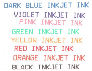
8 Colors Options