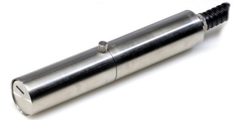
Esley Maintained Print Head with Precision 3 Piece Nozzle