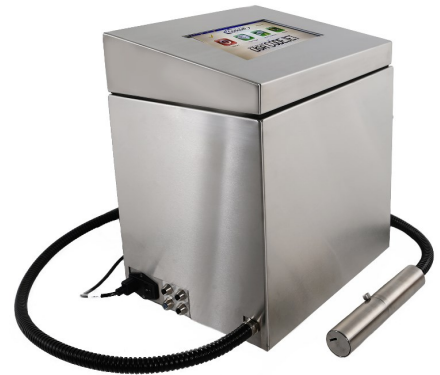
Industrial Quality Stainless Steel Enclosure